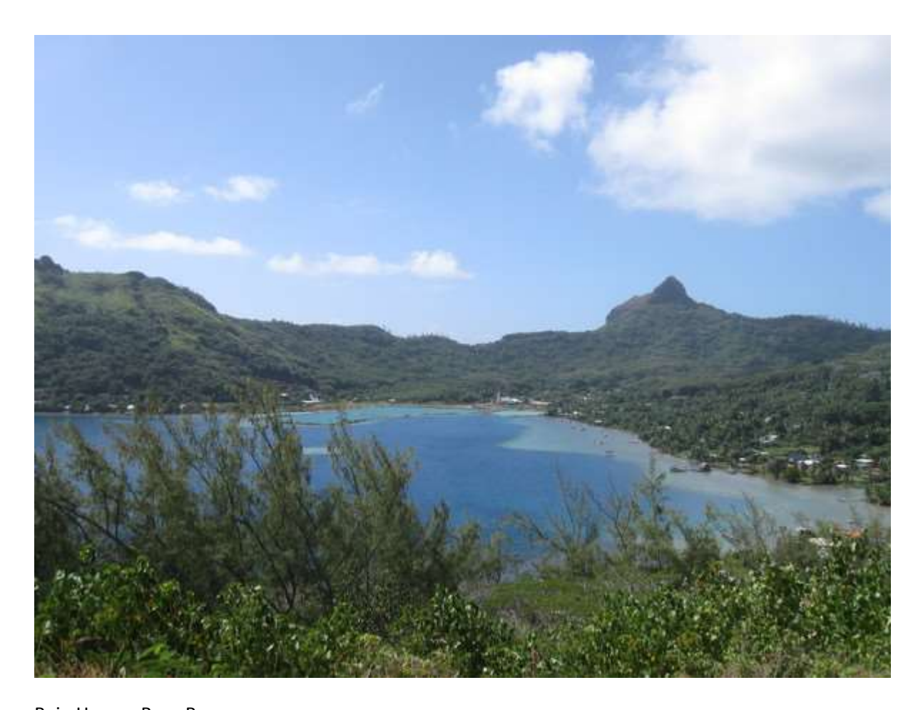
Baie Haapu, Bora Bora