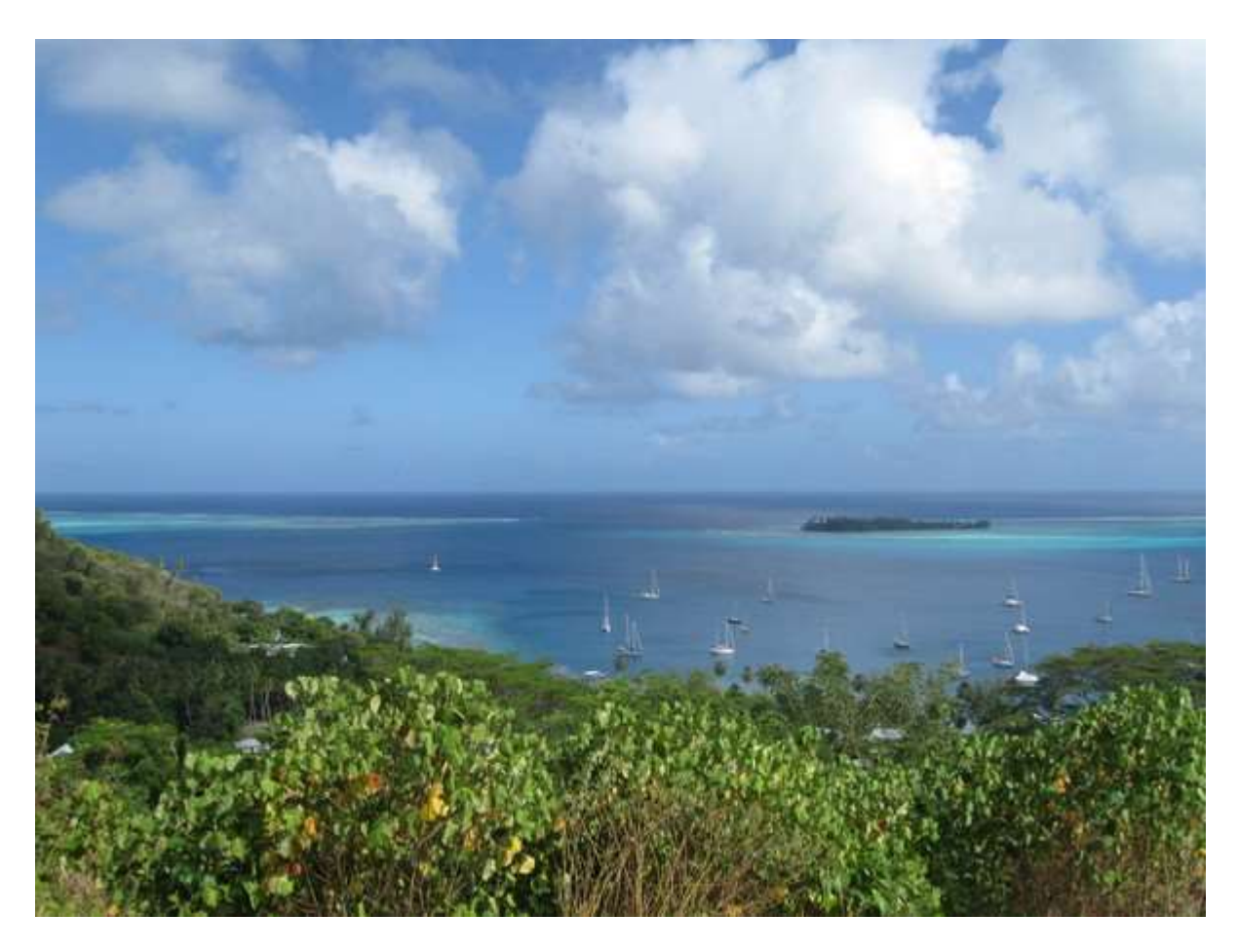
Moorings at the Bora Bora Yacht Club with the passage behind