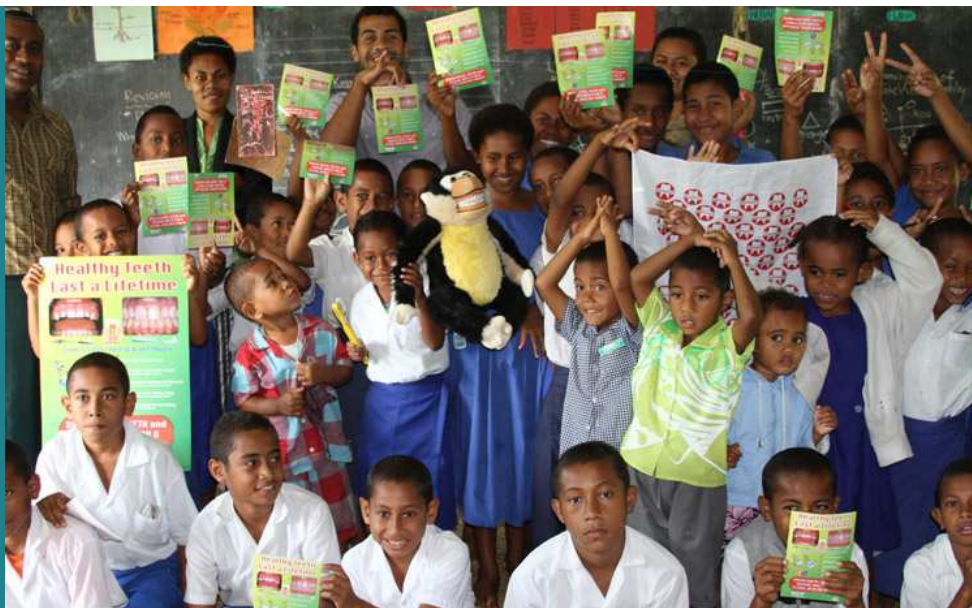
Early preventative care and education is essential, but we need your help