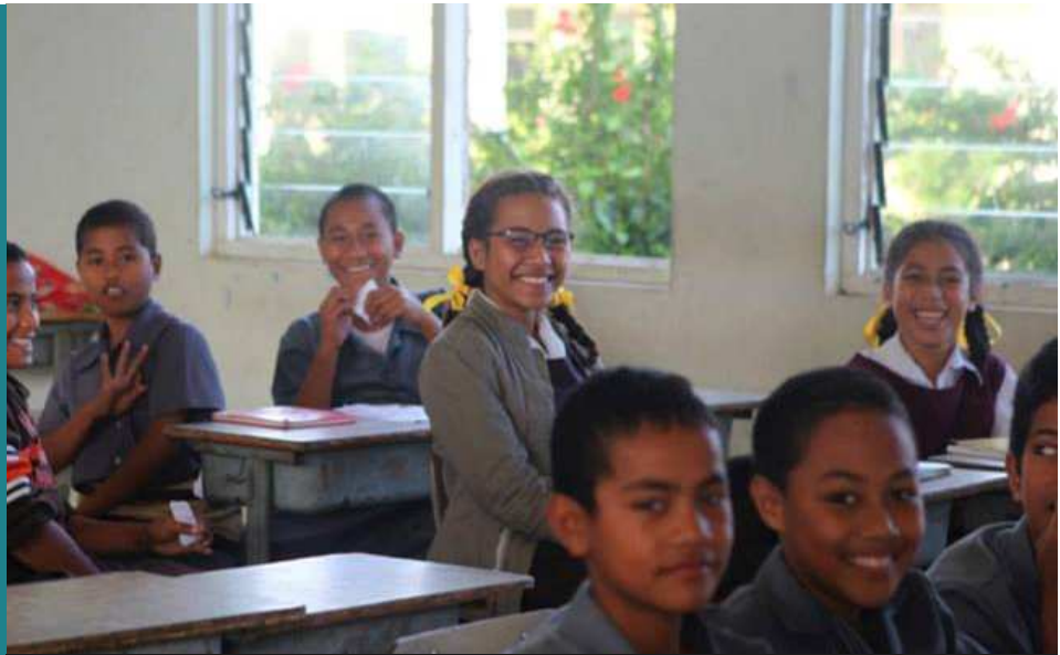
Guess who can finally see the chalkboard in class? Glasses can change a life forever!

Visit the above FHCC vessel pages online to learn more about each vessel and crew.