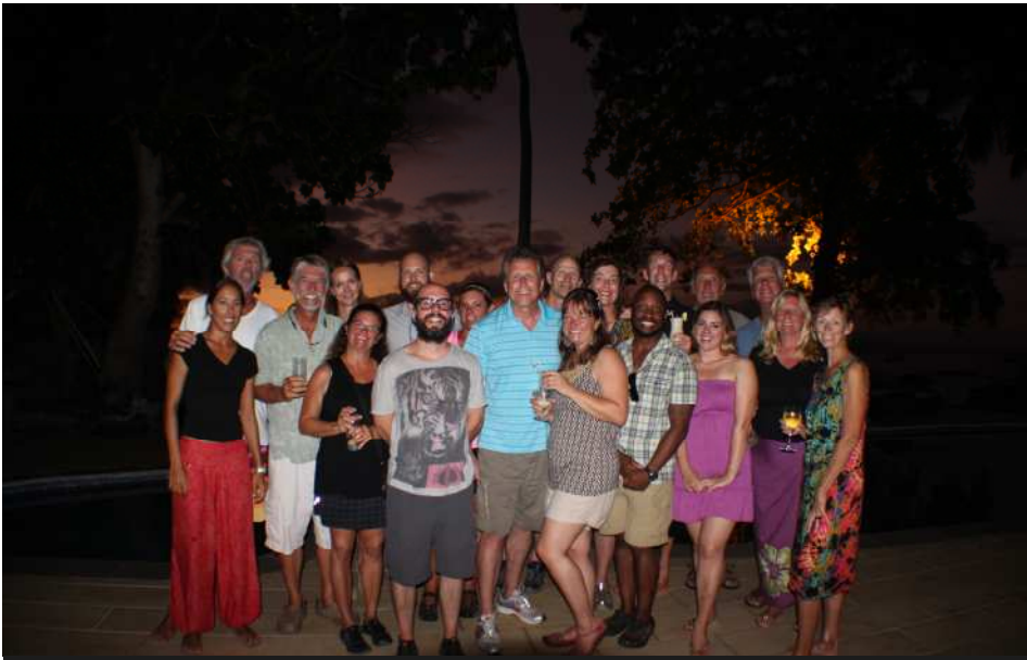
The Initial Scouting Team to the Lau Group in Fiji (21 team members and three specialties)