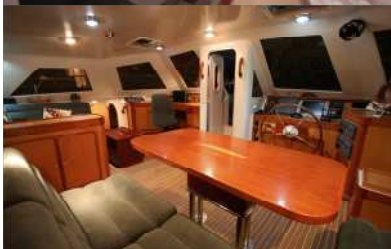
Vessels and accommodations!