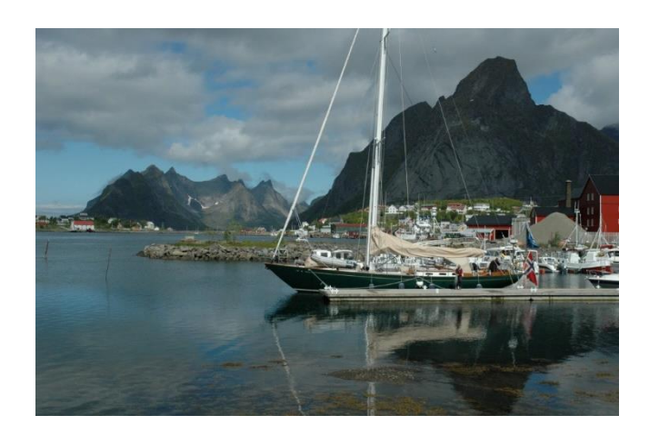
Jenny in Lofoten 2008